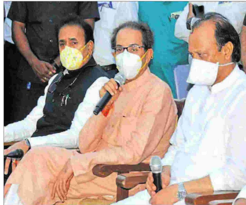
(From left) Home minister Anil Deshmukh, CM Uddhav Thackeray and deputy CM Ajit Pawar address the media at Vidhan Bhavan, on Wednesday.

Tweaking his decision announced in the state budget, Pawar announced on Wednesday to increase the excise duty on branded and non-branded country liquor to 220% from