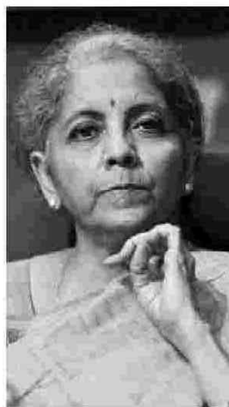
Nirmala Sitharaman, Finance Minister

Central excise duty, including basic excise duty, cess and surcharge on petrol and diesel (in ₹/litre)