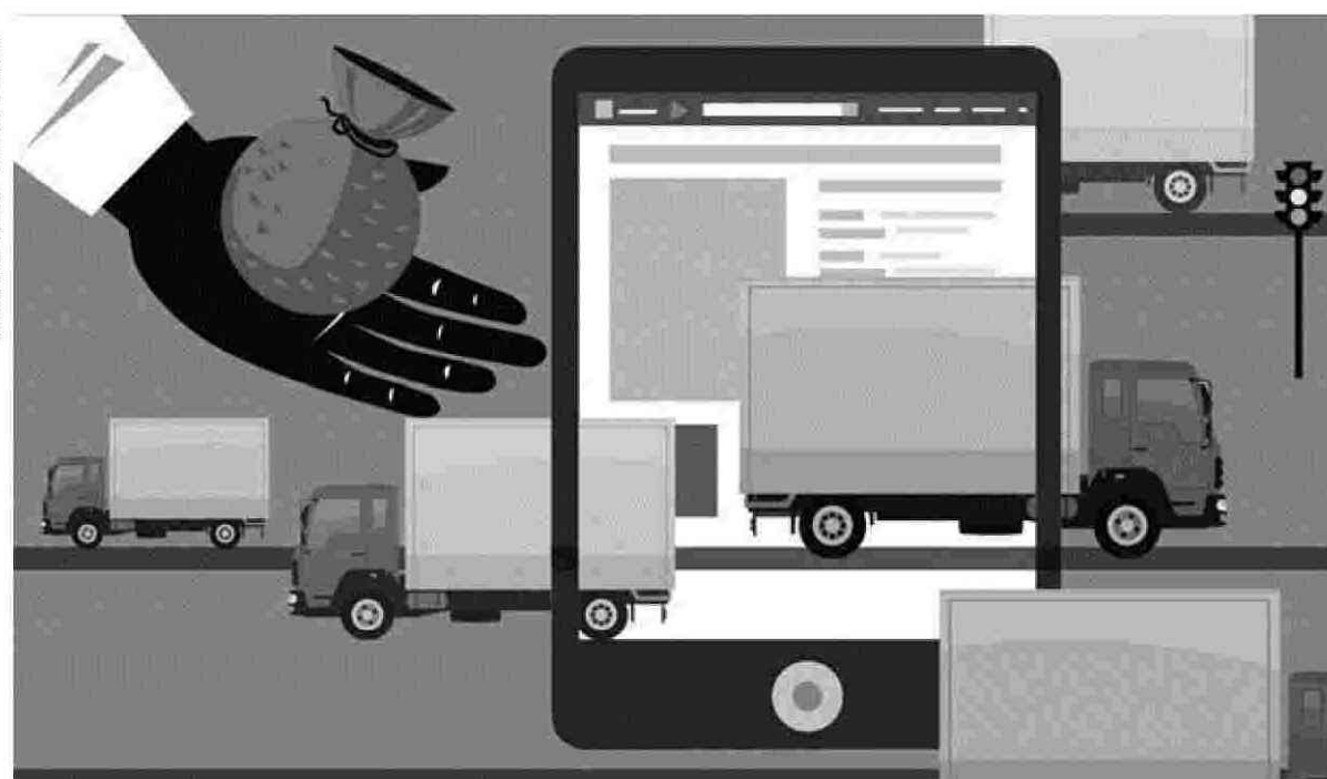
ILLUSTRATION: BINAY SINHA